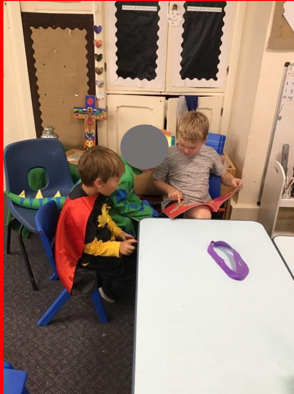
One of our pupils recently met Julia Donaldson ('The Snail and the Whale' among many others!) at the Monmouth Savoy Theatre.