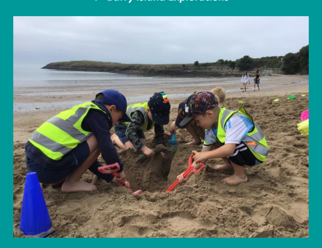
5 - Digging Deep