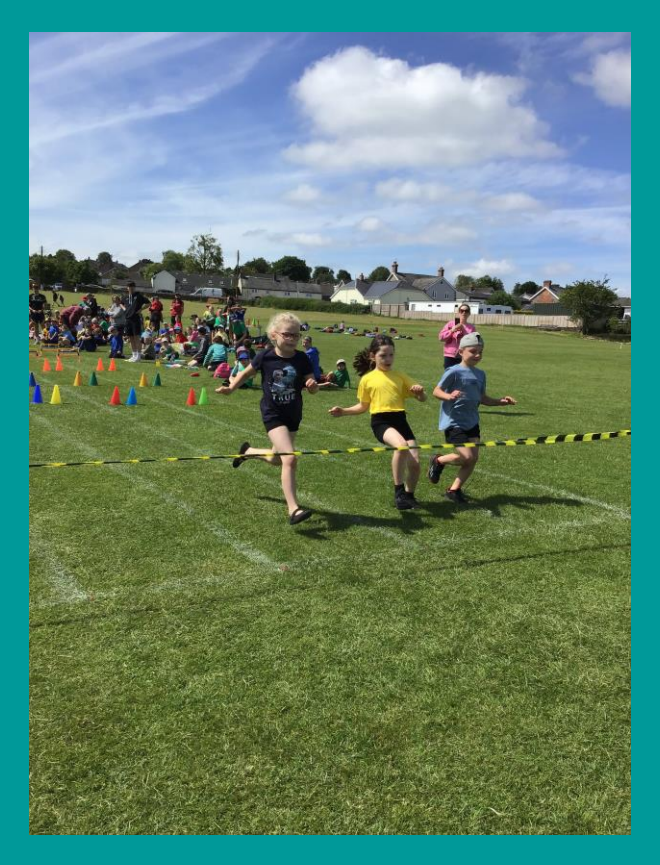
2 - Sports Day Action