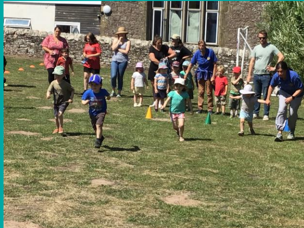
3 - The Sunflower children displayed their ability, courage and determination to give many different sports a try, when joining Bluebells in their sports day.