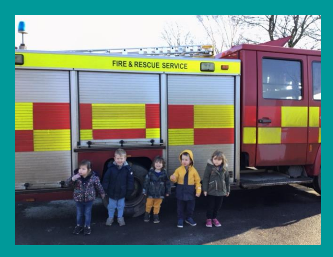
5 - Fire fighter visit