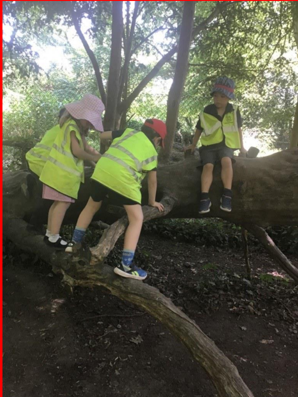
Beechenhurst & Goodrich Castle