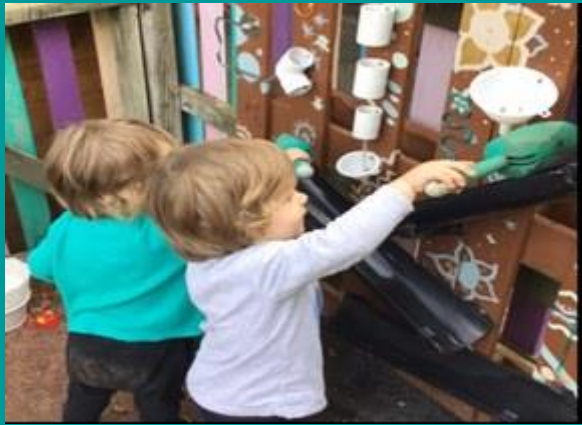
The children have been developing their friendship and team work skills.